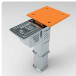
Offset Flanged Adapter