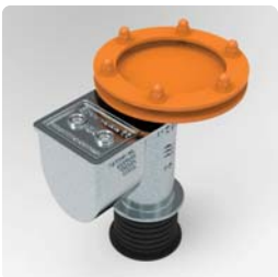
Circular Flanged Adapter